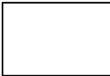
a spiky plant